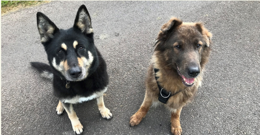
MOLLIE AND SKYE