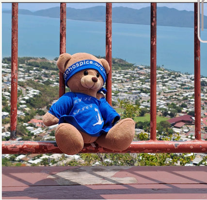
Townsville on Castle Hill