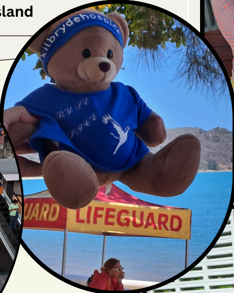
Saving lives (above) and Singapore Mall (left)