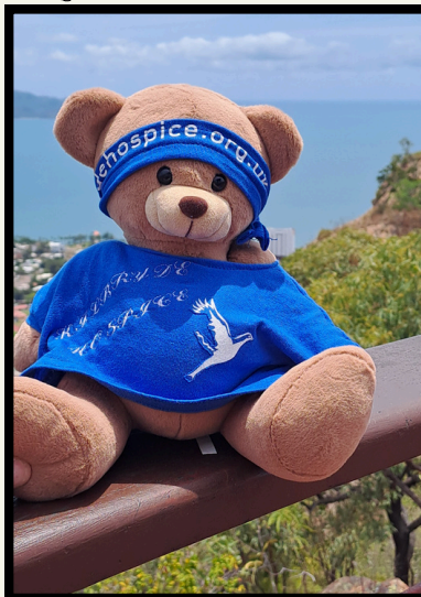
On Castle Hill again